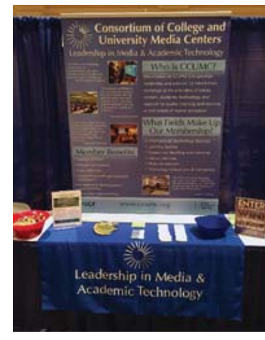
CCUMC Booth, UBTech16 Mirage Las Vegas

Membership renewals were distributed beginning in May. As of June 30th, we have had 139 institutions (237 individuals) and 21 companies (38 individuals) renew their membership. Membership renewal reminders will continue to be distributed through September 2016.